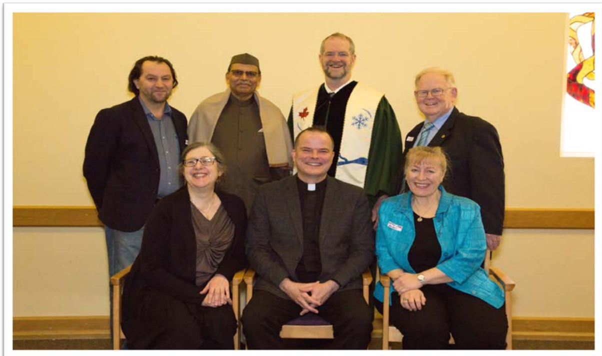
Patrons AGM 2016

MHI received its letters patent on October 30, 2002. It is a federally registered non-profit organization. MHI was registered as a charitable organization effective January 1, 2003. In April 2003, charitable status was confirmed in Quebec. In October 2004, the letters patent were amended to allow the purchase of housing to be rented to people with low incomes, and the Canada Revenue Agency approved this change early in 2005.