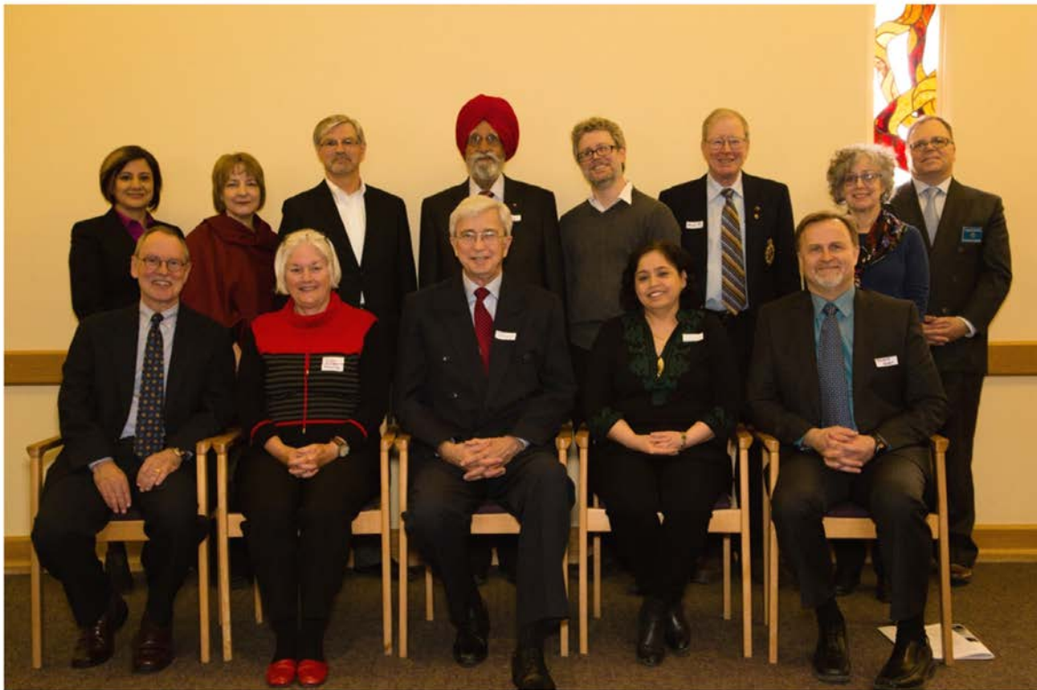
Board of Directors AGM 2016