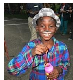
Having fun at the Blake House BBQ