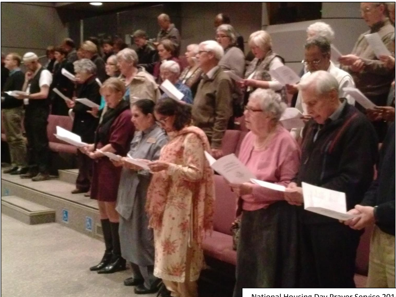
National Housing Day Prayer Service 2014