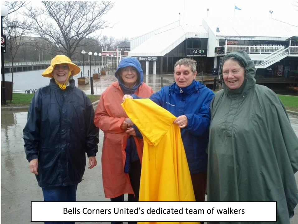
Bells Corners United's dedicated team of walkers